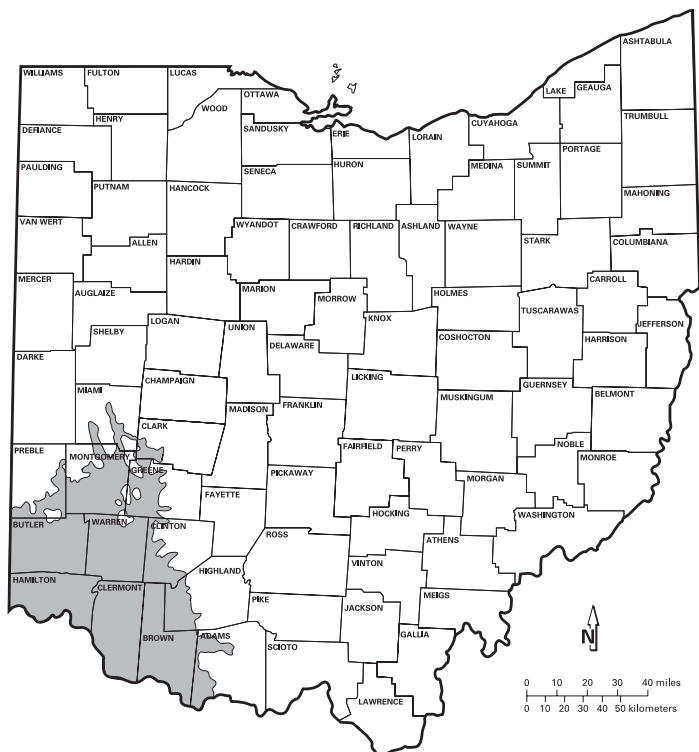
Outcrop area of Ordovician rocks in Ohio.